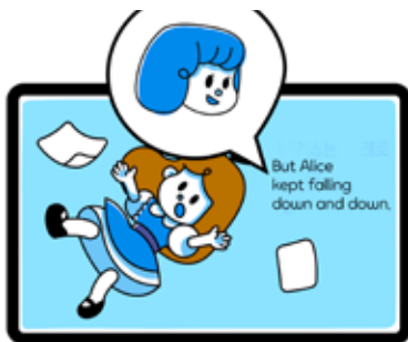
① Enter the story, Uncle Ben .